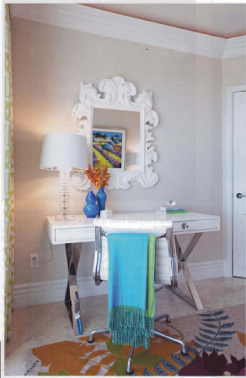
Calling the home's décor style "glamorous mod, and swanky," LaMarque's clients liked the idea of Vegas glitz, but also wanted the space to be very comfortable.

In addition to color, geometrics also made it onto LaMarque's design palette. "Then I found the rug with the circles and the tv console had the circular pattern, too. Also the circular orb of the living room's chandelier, I found that and I loved that and it just felt like it would light up the whole room. There's not a lot of room for decorative lighting. The main bedrooms can't have any chandeliers. And because we had only the one junction box in the living room, I knew I had to take advantage of it."