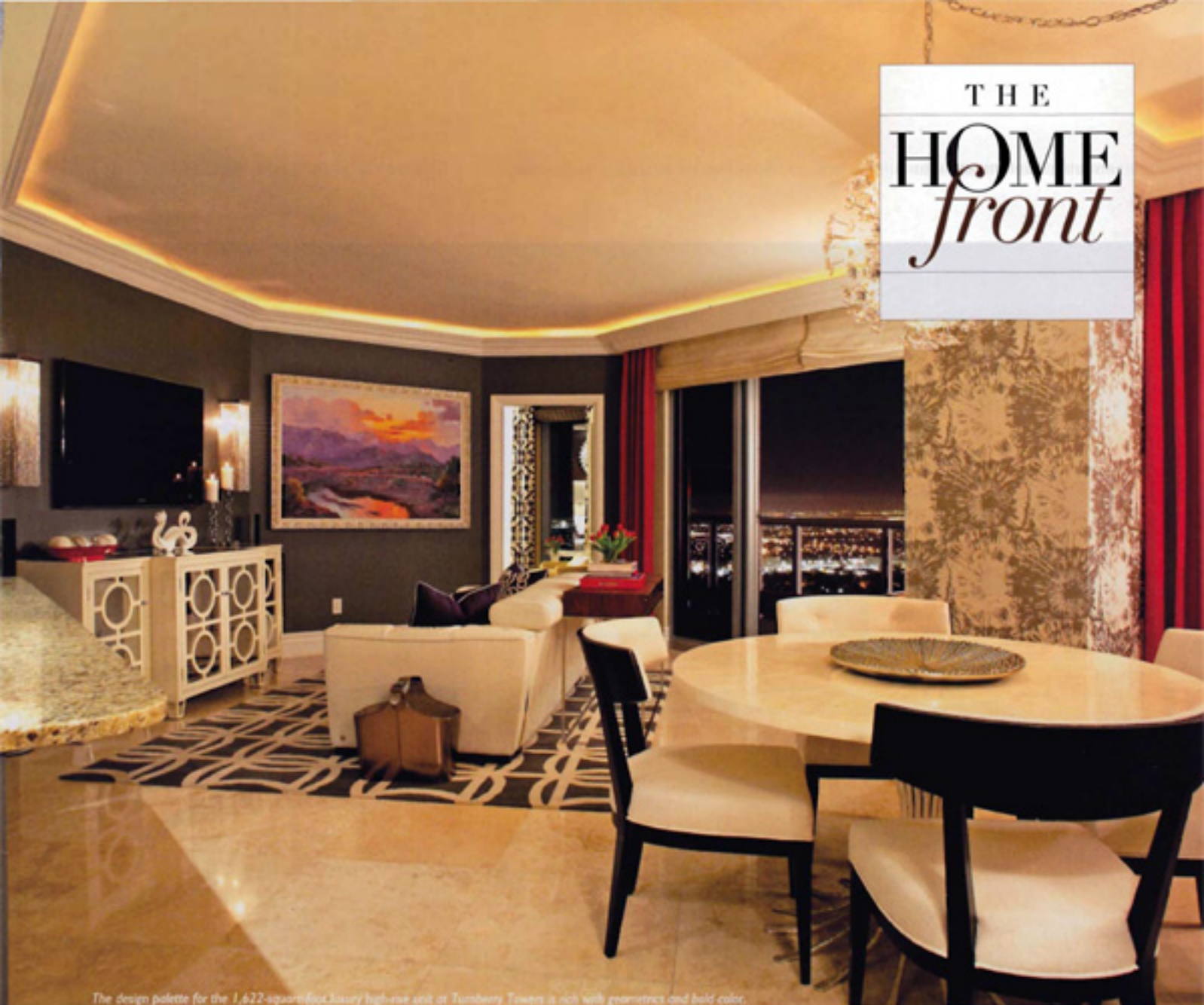
The design palette for the 1,622-square-foot luxury high-rise unit at Turnberry Towers is rich with geometrics and bold color.