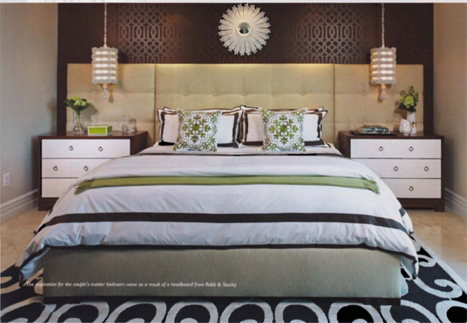
The inspiration for the couple's master bedroom came as a result of a headboard from Rabb & Sucky.